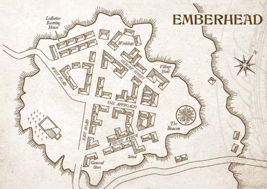
Map of Emberhead

To investigate behind the bookcase, go to 153. To close it and make your escape while you can, go to 120.