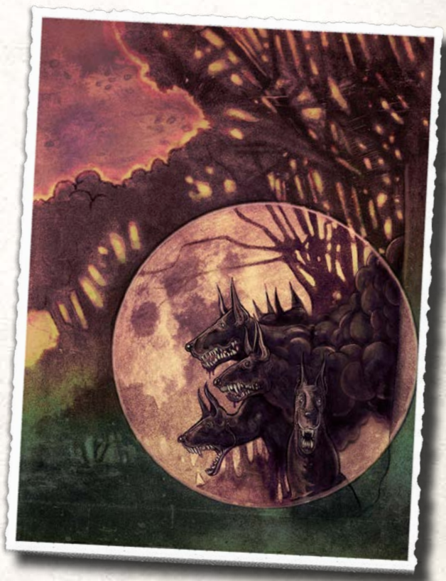
Pack of beasts